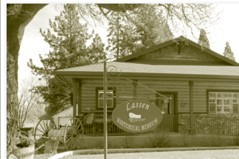
Lassen Historical Museum in Susanville, California.

Lassen County, home to Lassen National Forest and Lassen Volcanic National Park, is the eighth largest county in California. Paratransit Services is thrilled to be there, and we look forward to a long and productive relationship with LTSA.